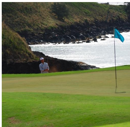
Hawai'i's Blaze Akana recovers from the greenside bunker on No. 14 at the Ocean Course at Hōkūala.

Statistically, the par-4 18th was again the most difficult hole, with 63 bogies (or worse) recorded with a 4.8 scoring average. Hole 4, a 506-yard par-5, produced a 4.19 scoring average, with 92 birdies (or better).